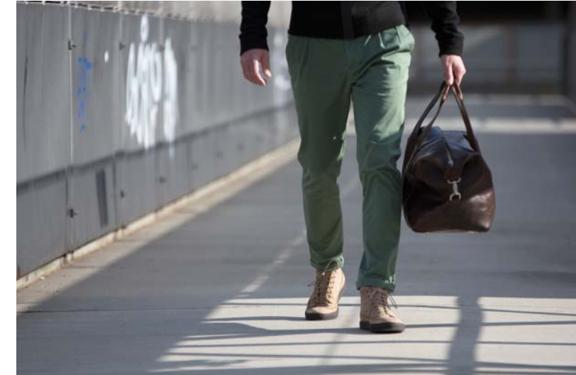
OPPOSITE PAGE The new Odile Low sneaker in Bog Oak.

Not only will the Horse Olive Leather Sneaker look the part, but the production process that results in the superb shoe will also be markedly environmentally conscious.